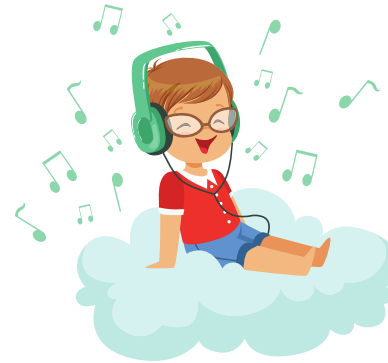
listen to music