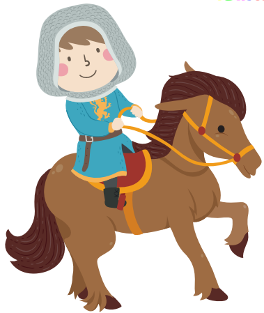
ride a horse