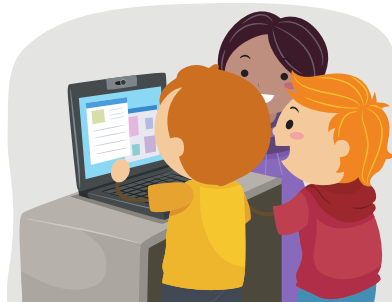
surf the internet